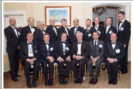
Board of Directors (2014-2015)